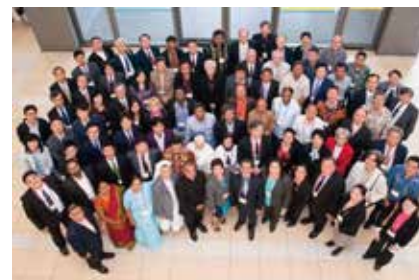
A group picture of the attendees at the 2013 ACUCA Management Conference.