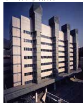
The University received approval from The Ministry of Science and Technology of China to establish the "Partner State Key Laboratory of Environmental and Biological Analysis"