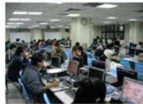
The primary school students concentrate on an interactive lecture offered by the student volunteers at the other end of the computer.

Student volunteers use web teaching software and the Internet to instruct the primary school students who dwell in the rural areas.