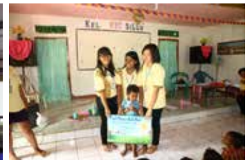
Art class at playgroup