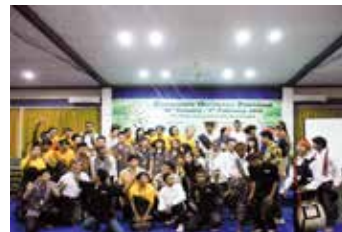
20130128-Participants at the Opening Ceremony in Kupang

Bidding farewell became a tough moment when the program reached the last day. Villagers, children, and local participants felt really sad to see the participants return to Surabaya. It was truly a memorable cross-cultural experience that cultivated participants' awareness of what a difference it can be for beautiful harmony and productive contributions to fill in the gaps with thoughtful understanding. Herewith, we would also like to invite all ACUCA members to join us in COP 2014!